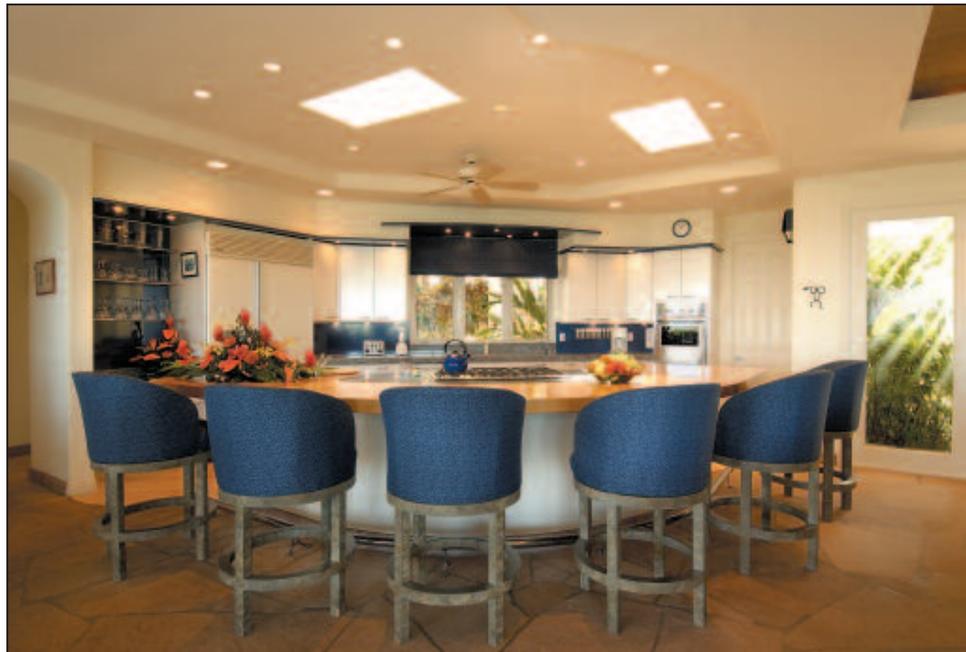
ABOVE: A semi circle of deep blue barstool by Gina B surround a butcher block kitchen island/work space. The blue theme is carried through to a collection of blue stem glassware and “fly-over” detail.