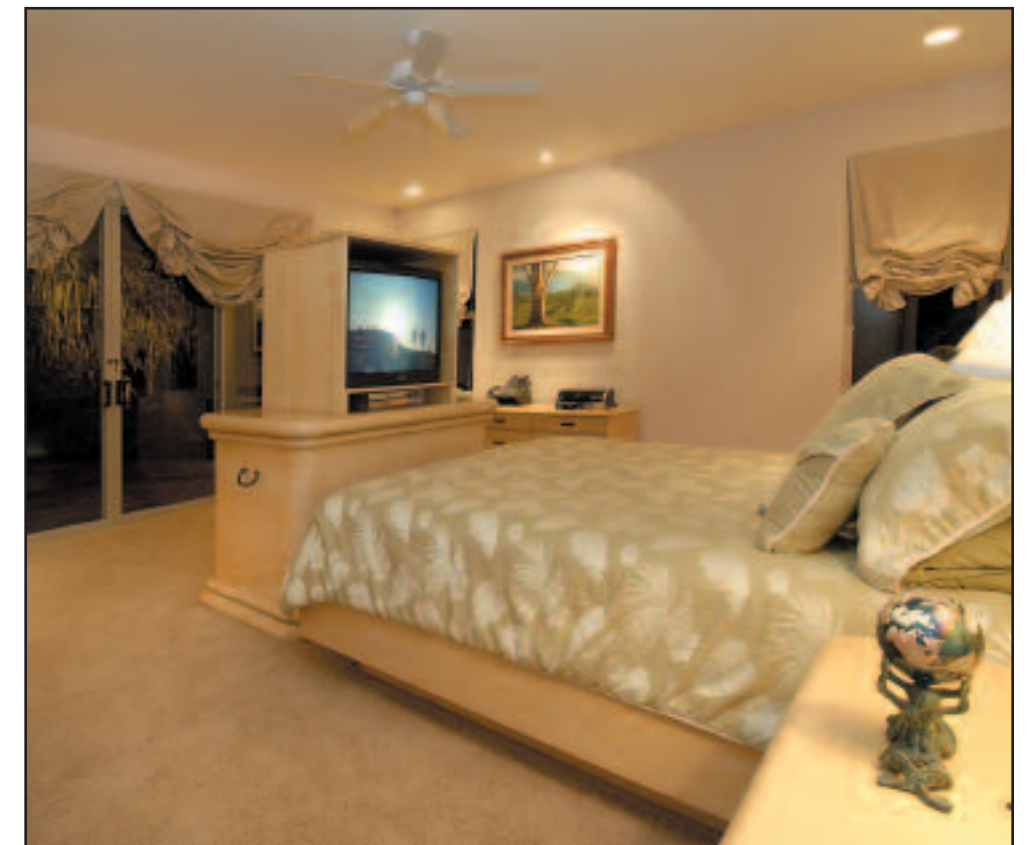
ABOVE & RIGHT: In the master bedroom a custom bed set, made of maple with mottled finish. A television pops up from console but, "isn't in the way when you want to see the ocean from the bed," comments Joy.