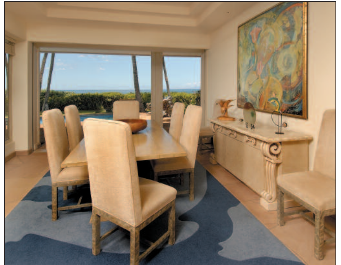
ABOVE: In the dining area, Holmes designed a second water rug created by Farbica. The natural chenille chairs are Gina B. Artwork by Piero Resta.

Two main areas of the Nelson’s home, the open living and dining rooms, are perfect examples of how that requirement was achieved. A key element is a pair of matching textural rugs that