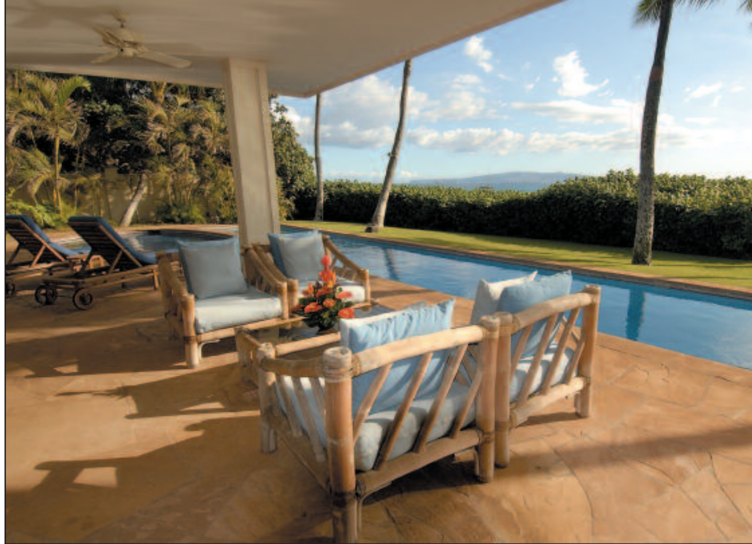
ABOVE AND BELOW: Reddish Arizona flagstone was used on the lānai and around the pool. An 8-ft overhang covers a grouping of bamboo lounge chairs.