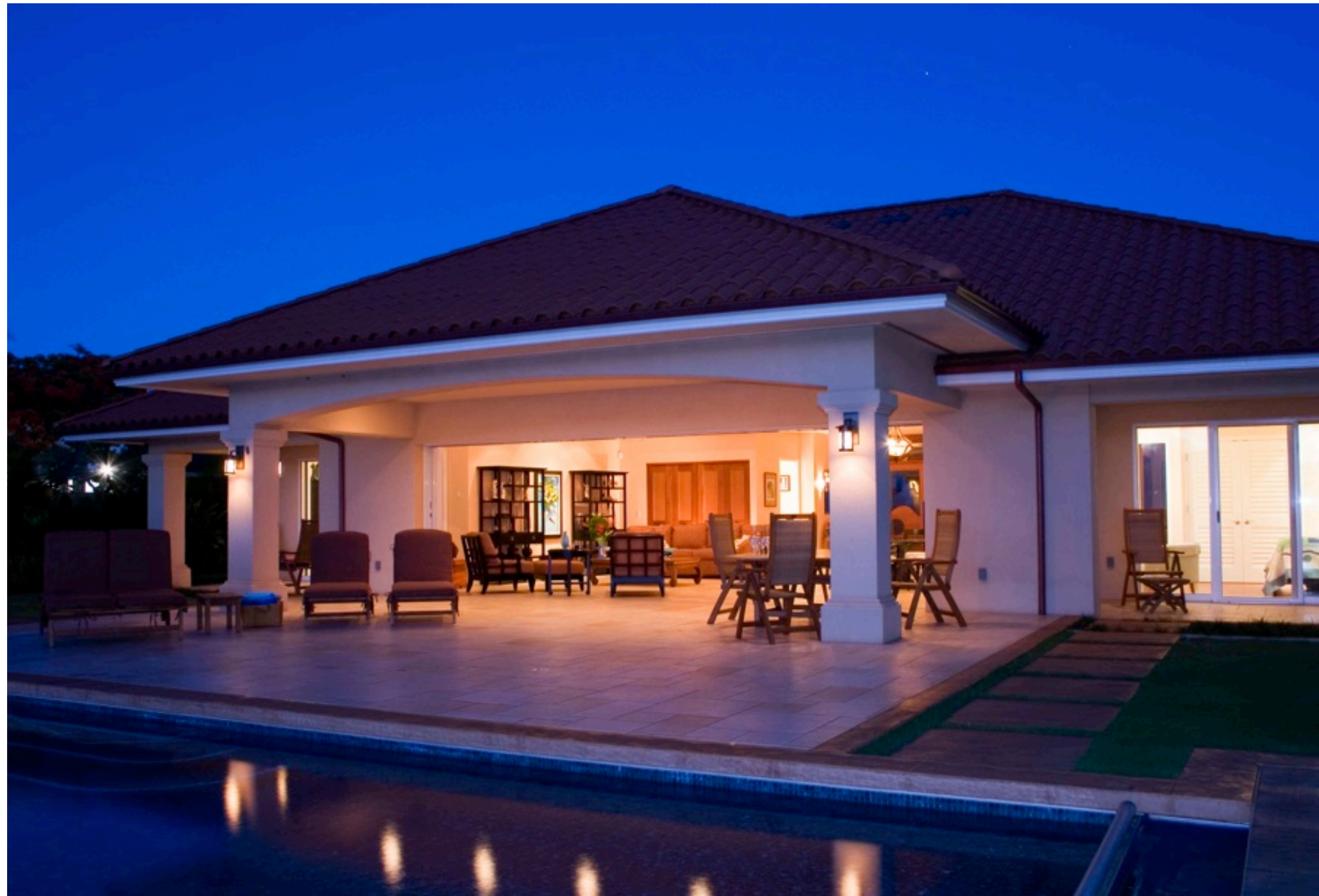
ABOVE LEFT: The changing sky and palm trees reflect in the infinity pool continuing the view out onto the ocean.