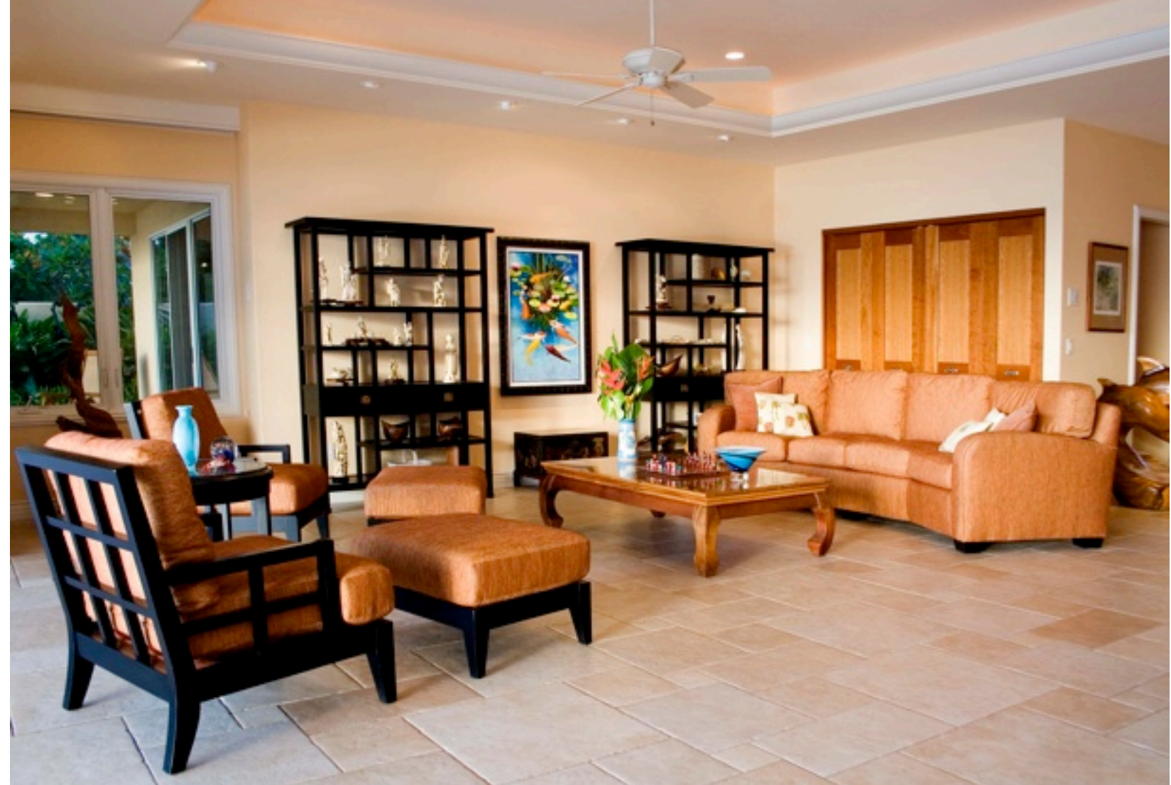
ABOVE: The client's collection of Japanese Netsukes are on display in the living room. Behind closed doors the centrally located home office is out of the way when not in use. BELOW: Visitors are greeted by the sandstone carved panel in the entry courtyard. Lotus plants and cranes rise out of the stone and merge with the surrounding landscape.

Many clients have asked this question over the years. Where do you begin? What do you select first? The answer? It depends. Yet when a new client walks in the door with a beautiful pottery vessel in sunset colors and states "this is going in our new home and we want everything in these colors" you have a specific directive.